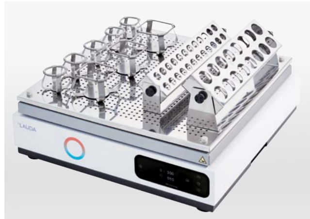
Modern digital controls and extended range of functions – Varioshake VS 15 O and VS 15 B