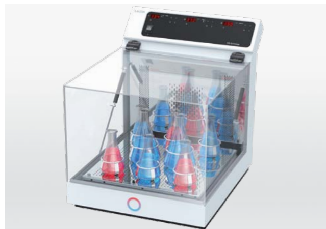
Varioshake VS 60 OI – compact, economic, powerful

Simple and compact or robust with several shaking levels: LAUDA Varioshake shaking incubators are specialists in mixing and shaking with exactly reproducible circular movements and temperatures up to 70 °C. They offer comprehensive functionality and optimum temperature distribution throughout the chamber.