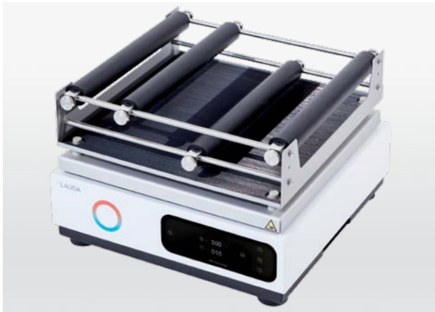
The robust entry-level shakers with digital controls – Varioshake VS 8 O and VS 8 B

LAUDA Varioshake shakers score with superior quality, durability and absolute reliability. Their sturdy, low-wear mechanical system ensures extremely smooth operation and reliable continuous duty. Varioshake shakers and tailored accessories are the ideal solution whenever careful mixing or vigorous shaking are required.